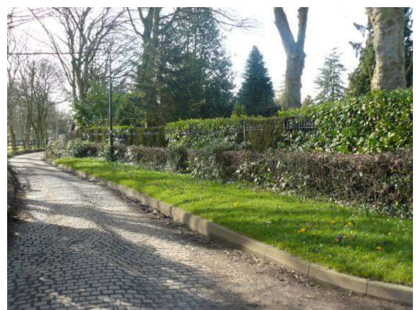
Surviving setts, which make a positive contribution to the character of the Conservation Area

2.5.3 The street furniture comprises a combination of traditional-style and municipal modern. The character of the Conservation Area is better echoed in the traditional-style features and there may be opportunities in the future to replace lower quality features with better alternatives in a more traditional style.