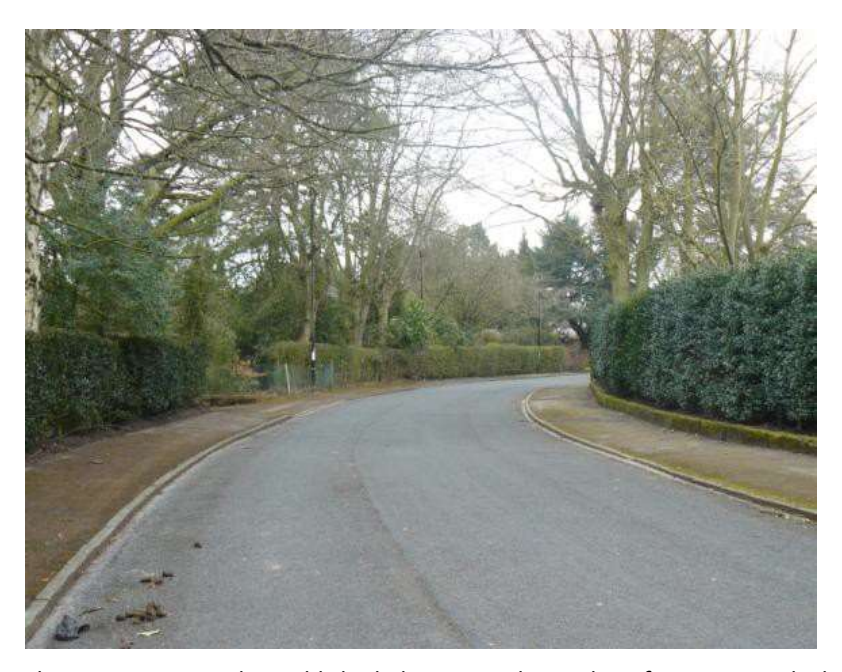
South Downs Drive, with established planting and a quality of pavement which is lacking elsewhere in the Conservation Area

2.6.2 The open fields surrounding the Conservation Area offer attractive views out of the Conservation Area. The main part of the Conservation Area is generally quite enclosed with winding roads lined with mature trees, resulting in a distinctive, idyllic streetscape. It is important that this is retained through the on-going management of the established planting, implementation of traffic management schemes and the appropriate positioning of any new development. New planting should be allowed to mature in order to continue the established character of the Conservation Area.