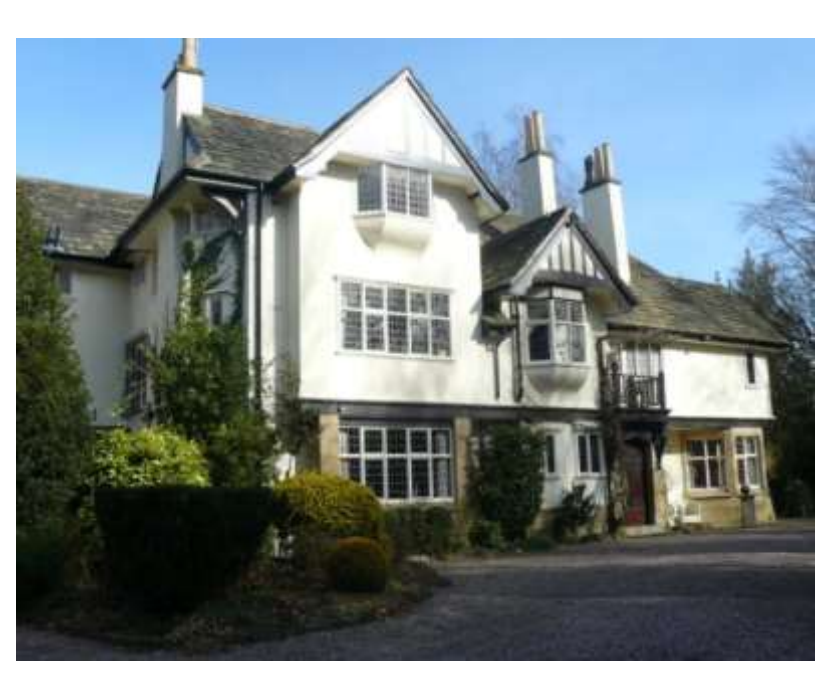
An example of the characteristic varied roofline, use of half-timbering and render