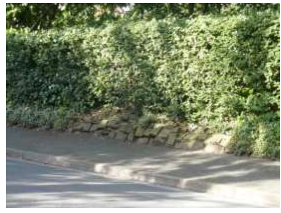
Left - inappropriate supplementary boundary treatment; Right - characteristic boundary treatment

2.4.3 Timber is an appropriate material for entrance gates. These should be of a high-quality design incorporating an open element and not exceeding 1.5m in height. Traditionally-designed wrought iron may also be appropriate. Side-hung gates are preferred over sliding alternatives and there are a number of surviving historic hinges throughout the Conservation Area which could be brought back into use. The characteristic historic gate posts of local stone should be retained where they survive and any new gates should be proportionate to these. Where new gate posts are to be inserted, local stone carved in a traditional manner is the preferred option. Overly-large gate posts in an unsympathetic